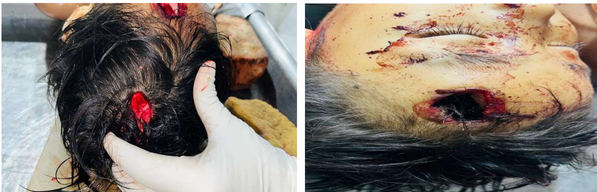
Figure 2. Depressed open comminuted fractures of skull bones