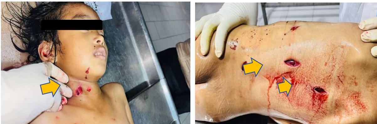
Figure 4. Incised wound over the front of the neck