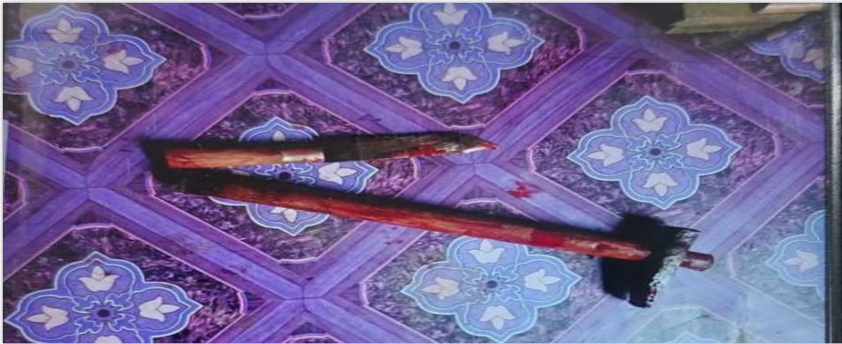
Figure 1. Showing blood stained kitchen knife and hammer